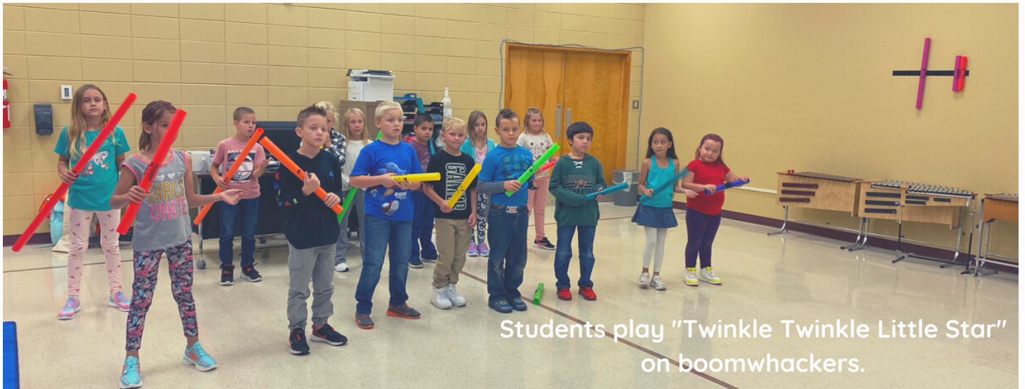
Students play "Twinkle Twinkle Little Star" on boomwhackers.