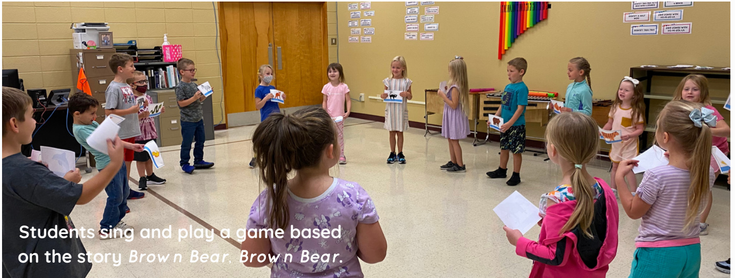
Students sing and play a game based on the story Brown Bear, Brown Bear .